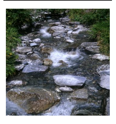
Benchland Water District Offices located at: 485 East Shepard Lane Kaysville, Utah 84037

The Charge pays for irrigation service from April 15th through October 15th of that season at which time the service is discontinued for the year.