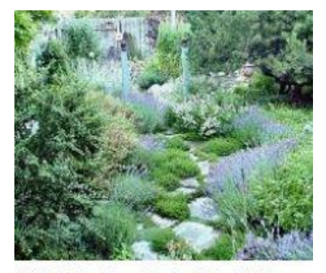
Utah Water-Wise Plants (Utah Division ... waterwiseplants.utah.gov

Water charge per ac ft. $15.00 Contract requires 3 ac ft per acre (minimum - $100.00 per acre) Commercial, Residential and Government over 2.0 Acres Track Charge $182.00 Water charge per ac ft $30.00 Contract requires 4 ac ft per acre (minimum - $120.00 per acre) Pumping Facility Users: Track Charge $182.00 Acreage Use Charge _ Operation Cost $100.00 (Replacement Charge for Pumping) Electrical Charges (Pass-through charge for Pumping) Total Charges