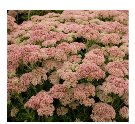
Water-wise plant - Sedum 'Autumn Joy'